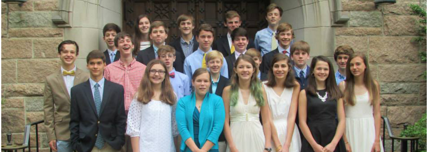
2015 Confirmation Class