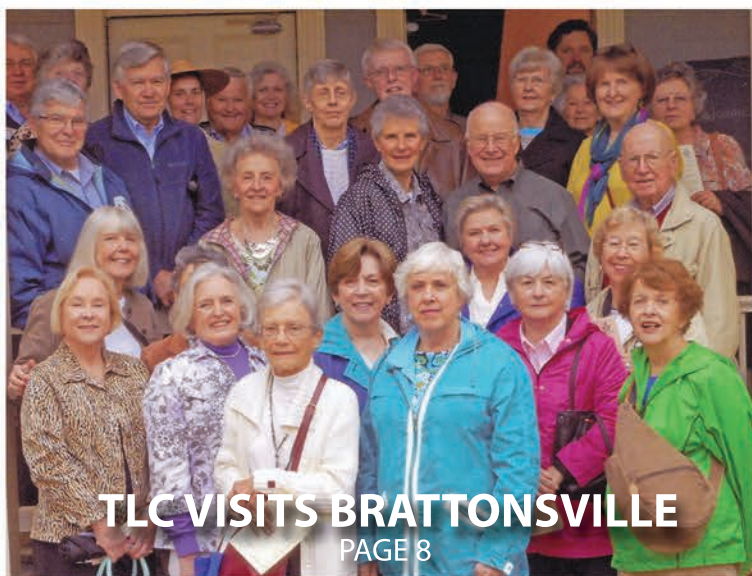
TLC VISITS BRATTONSVILLE